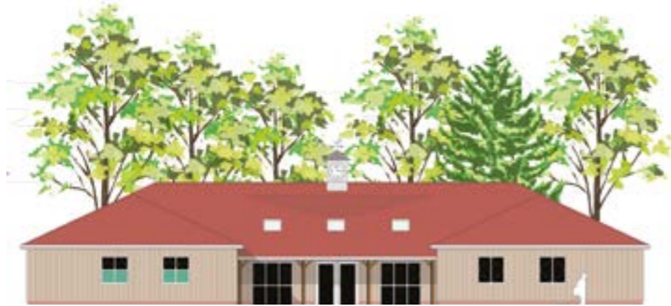
Elevation facing the football pitch (drawings copyright Michael Weakley 2018)

Liss is a growing village. Studies for the Liss Neighbourhood Plan and consultations with residents tell us that a new, multi-purpose facility for our community is wanted, particularly as the existing Pavilion on the West Liss Recreation ground and the adjoining Scouts Hut are in a poor state and have reached the end of their useful lives.