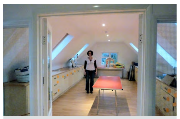
The Loft used by the Crossover, Hillside Children's Centre, and Connections Advice service for teenagers.

However, in order to keep up this good work there is urgent need for more adult volunteers, both to help run the daily sessions and also to help keep the centre clean. Could you spare a couple of hours a month (or a week or fortnight) to volunteer on a Tuesday, Wednesday or Thursday night – supervising young people aged between 10 and 17 years old? Reliability is key! Would you be able to give a couple of