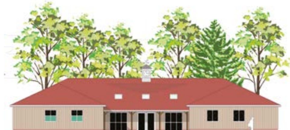
Elevation facing the football pitch (drawings copyright Michael Weakley 2018)

Liss is a growing village. Studies for the Liss Neighbourhood Plan and consultations with residents tell us that a new, multi-purpose facility for our community is wanted, particularly as the existing Pavilion on the West Liss Recreation ground and the adjoining Scouts Hut are in a poor state and have reached the end of their useful lives.