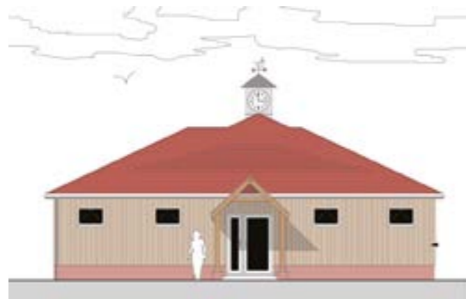
Elevation facing Station Road

We have obtained planning permission for a building which we believe reflects your views. The planning application, with all the details of the Pavilion, is SDNP/17/05105/FUL and can be viewed at http://www.southdowns.gov.uk/planning/planning_applications/