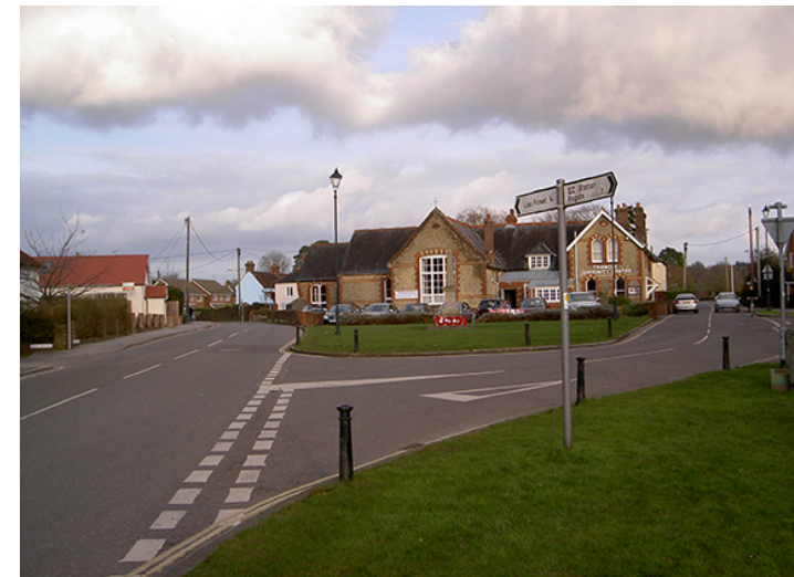
The Triangle Centre, Liss

The village facilities for young people are limited at weekends, as the Crossover drop in centre is only open during weekdays. For the elderly there is a very popular weekly luncheon club held in the village hall.