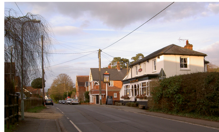
Liss Forest, Forest Road and The Temple PH

An Edwardian village centred on Forest Road with its shop, pub and one church. The heavily wooded land surrounding the area gives it a very rural feel. Like other comparable villages the shop is under threat and may only be viable if run by the community itself.