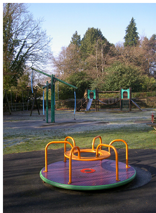
Children's play area at Liss Forest rec.

The village halls in Liss and Rake and 3 churches provide meeting places for clubs and societies and can be hired for events and social functions, but none of these is suitable for playing badminton. The village also benefits from 5 public houses and the British Legion which also host events and functions