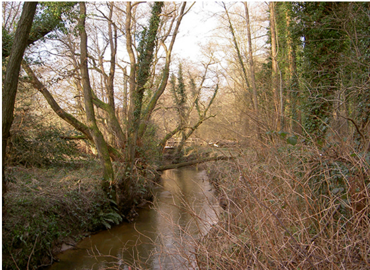
Riverside Railway Walk - River Rother

This was supported by the VDS exhibition in October 2007 when villagers voted the views of hills, the sunken lanes, the birds and wildlife and the trees throughout the parish, as the top 4 characteristics which made Liss special.