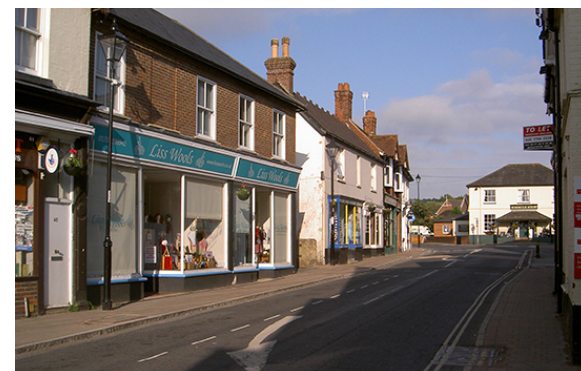
Period shops within Conservation Area, Station Road, Liss

When looking at the hospitality offered within Liss this is well catered for by the 5 public houses, the British Legion and a wide range of restaurants and take-a-ways offering a variety of cuisine including Indian, Italian, Chinese and Fish & Chips, all of which appear to be doing moderately well.