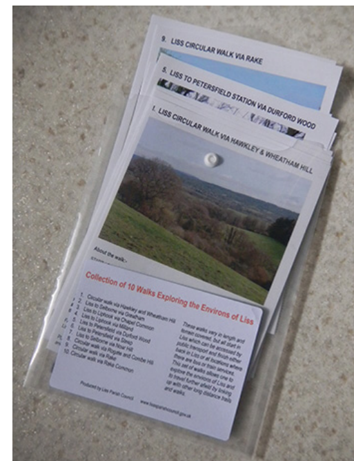
Collection of 10 walks radiating from Liss