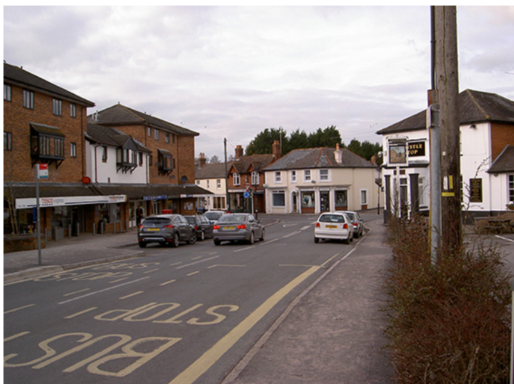
Lower Mead, Liss village Centre

The recent re-development of the Crossing Gate PH site to residential coupled with the new block paving in Station Road and the repainting of many of the businesses has enhanced the village centre, but more could be done to improve the ambience especially at the Lower Mead development.