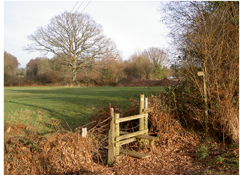
Public Footpath at Palmers Farm, Rake Road