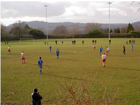
Football at Newman Collard Playing Fields

Liss has a notable shortage of open space close to residential areas, but provides play equipment for very young children and basket ball practice areas for young people in Liss Forest and at the Newman Collard grounds. However it lacks play equipment for older children. Tennis courts are available at the Newman Collard and football pitches are located both at Newman Collard and West Liss. The village also has a cricket ground. There are 2 sports pavilions; the one in West Liss is in urgent need of rebuilding. Villagers have access to a wider range of sports or swimming in Petersfield or Alton.