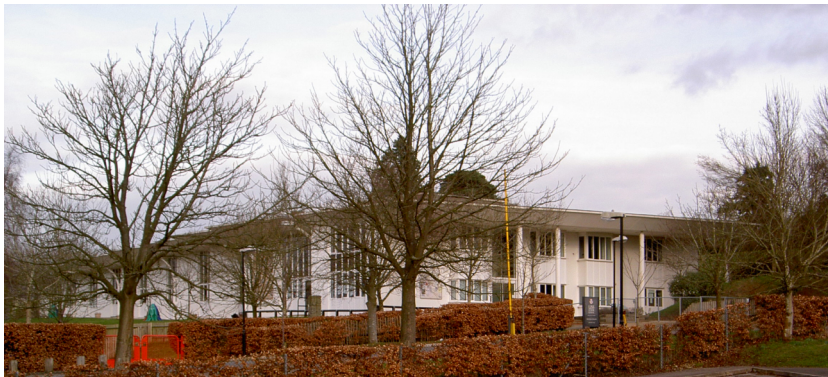
Liss Junior School

The centre of Liss is now refurbishing itself with new developments behind the shops, the repainted Whistle Stop PH and the redeveloped Crossing Gate PH. Although some businesses remain closed Station Road has benefited from the new blockwork pavements including some widening of the western pavement. There continues to be very few trees, shrubs or flowers in the centre to break down the feel of the centre being urban along its western frontage.