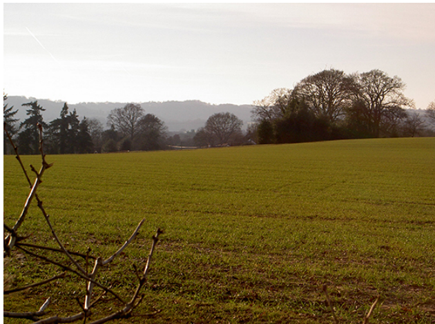
Liss a hidden village

Liss is important for biodiversity as it has 25 SINC's (Sites of Importance for Nature Conservation) and many important unimproved sunken lanes within the parish. Longmoor on the edge of Liss Forest is part of the Wealden Heaths Special Protection Area. The Riverside Railway Walk (RRW) is a local Nature Reserve and is managed by local volunteers.