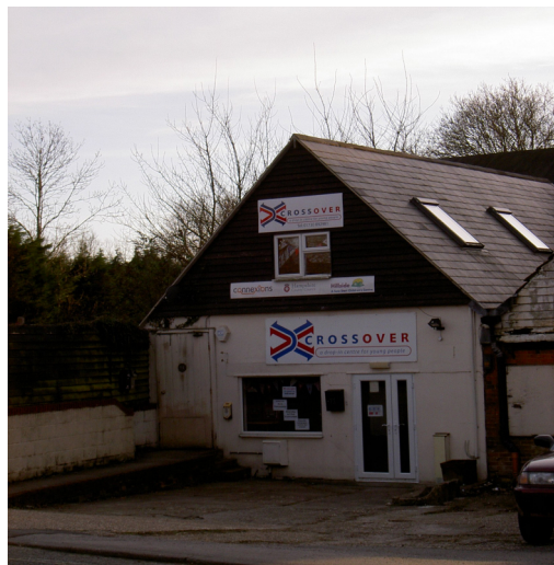
The Crossover drop in centre, Station Road, Liss

The overwhelming issues were lack of space for expansion, the need for dedicated space for activities for the young, the dilapidation of the Scout hut and the pavilion on West Liss Recreation ground, and availability of car parking at the various venues.