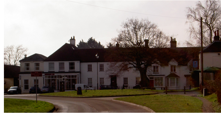
The Plestor, West Liss

Is the original settlement with its 13 th Century church and a variety of Victorian and Edwardian buildings reflecting its history. It now extends to the West Liss recreation ground near St Mary's Church.