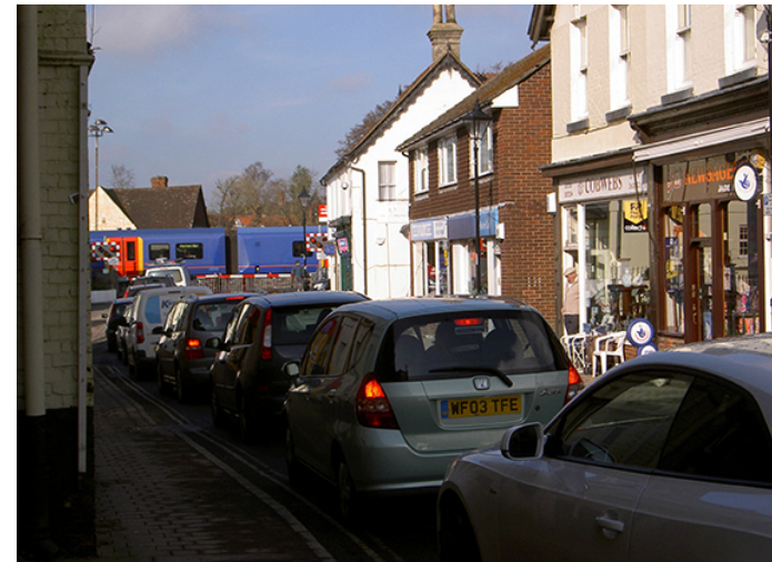
Traffic congestion at Station Road level crossing

The evidence of the 2011 exhibition and questionnaire shows inconsiderate car parking as being a double edged sword. As parked cars on the highway act as a traffic calming measure forcing the speed of vehicles to be reduced, but in the bus lay-by outside of Tesco parked cars were causing real danger to other road users and pedestrians.