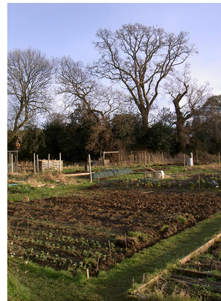
Allotments at Rake Road

In the 2011 questionnaire more emphasis was placed on providing better access to both footpaths and allotments for the less able and more vulnerable residents, with 72% of those who expressed an opinion agreeing that disabled access to the footpaths should be improved, and 70% supported the idea of providing allotments designed for people with disabilities if it is possible.