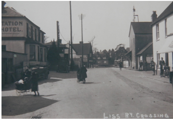
Old postcard showing Liss crossing circa mid 1920's

Liss is considered a small local service centre in the settlement hierarchy of the yet to be adopted East Hampshire District Local Plan – Joint Core Strategy (chapter 4). With regard to transport, Liss is close to the A3(T) with access points at Ham Barn roundabout, Flexcombe to the south and near Greatham to the north. There is therefore a significant traffic flow accessing the A3(T) through Liss and this includes heavy lorries.